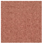
L4172011 Rouge de chine