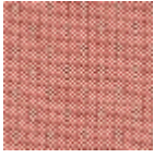
L4178_POINT_ DE_TOURS_Et oilé_N3026_N3 028