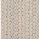
L4216003 Bleu rouge