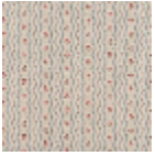
L4216003 Bleu rouge