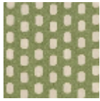
L4227_LES_EM ERAUDES_Can evas_B23_B91_ FE_Verso