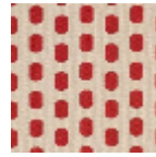
L4227_LES_EM ERAUDES_Can evas_N3103_FE _Verso