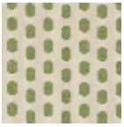
L4227_LES_EM ERAUDES_Can evas_B23_B91_ FE