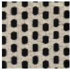
L4227_LES_EM ERAUDES_Can evas_C508_FE