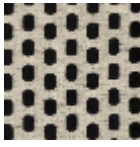
L4227_LES_EM ERAUDES_Can evas_C508_FE