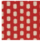
L4227_LES_EM ERAUDES_Can evas_N3103_FE