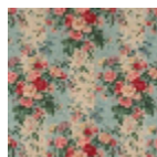
L4238001 Bleu vert