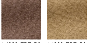
L4289_TDT_B9 4 Eléphant L4289_TDT_B9 5 Mastic