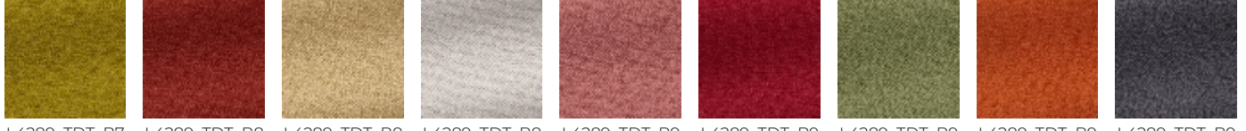
L4289_TDT_B7 6 Chartreuse L4289_TDT_B8 4 Rouge de chine L4289_TDT_B8 7 Crème L4289_TDT_B8 8 Blanc L4289_TDT_B9 Tremiere L4289_TDT_B9 0 Groseille L4289_TDT_B9 1 Vert nil L4289_TDT_B9 2 Capucine L4289_TDT_B9 3 Anthracite