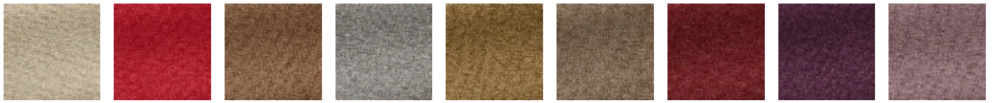
L4289_TDT_B0 Ecrû L4289_TDT_B0 2 Rouge fushia L4289_TDT_B0 4 Cianduja L4289_TDT_B0 6 Flanelle L4289_TDT_B0 8 Laurier L4289_TDT_B11 Loutre L4289_TDT_B1 3 Bordeaux L4289_TDT_B1 4 Prune L4289_TDT_B1 5 Pensée