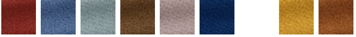
L4289_TDT_B4 1 Rouille L4289_TDT_B4 2 Bleu toile L4289_TDT_B4 5 Bleu ciel L4289_TDT_B4 6 Bronze L4289_TDT_B5 Ramie L4289_TDT_B5 3 Bleu marine L4289_TDT_B5 4 Bleu marine L4289_TDT_B5 6 Mais L4289_TDT_B5 7 Giroflée