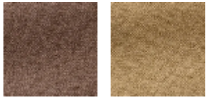
L4289_TDT_B9 4 Eléphant L4289_TDT_B9 5 Mastic