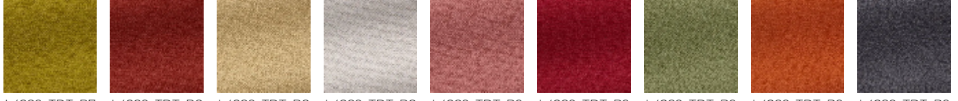
L4289_TDT_B7 6 Chartreuse L4289_TDT_B8 4 Rouge de chine L4289_TDT_B8 7 Crème L4289_TDT_B8 8 Blanc L4289_TDT_B9 Tremiere L4289_TDT_B9 0 Groseille L4289_TDT_B9 1 Vert nil L4289_TDT_B9 2 Capucine L4289_TDT_B9 3 Anthracite