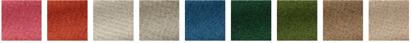
L4289_TDT_B1 6 Framboise L4289_TDT_B1 7 Tomate L4289_TDT_B1 9 Lin L4289_TDT_B2 0 Fumée L4289_TDT_B2 1 Bleu ming L4289_TDT_B2 2 Vert sapin L4289_TDT_B2 3 Vert pré L4289_TDT_B2 4 Chevreuil L4289_TDT_B2 6 Albatre