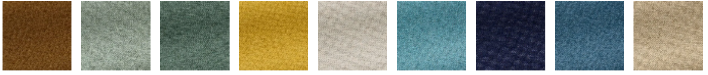
L4289_TDT_B2 8 Chamois L4289_TDT_B3 0 Atoll L4289_TDT_B3 1 Vert L4289_TDT_B3 2 Citron L4289_TDT_B3 4 Blanc cassé L4289_TDT_B3 7 Adriatique L4289_TDT_B3 8 Denim L4289_TDT_B3 9 Bleu canard L4289_TDT_B4 0 Bouleau