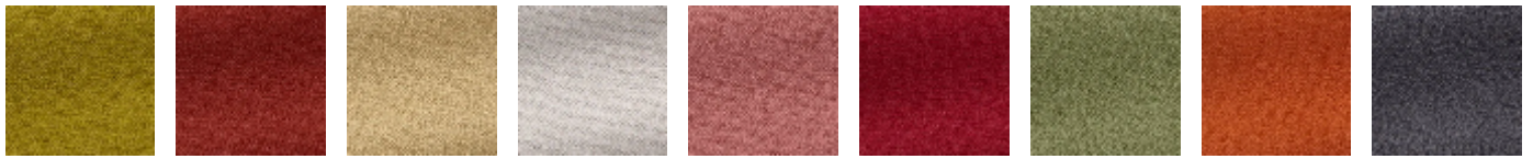
L4289_TDT_B7 6 Chartreuse L4289_TDT_B8 4 Rouge de chine L4289_TDT_B8 7 Crème L4289_TDT_B8 8 Blanc L4289_TDT_B9 Tremiere L4289_TDT_B9 0 Groseille L4289_TDT_B9 1 Vert nil L4289_TDT_B9 2 Capucine L4289_TDT_B9 3 Anthracite