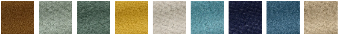
L4289_TDT_B2 8 Chamois L4289_TDT_B3 0 Atoll L4289_TDT_B3 1 Vert L4289_TDT_B3 2 Citron L4289_TDT_B3 4 Blanc cassé L4289_TDT_B3 7 Adriatique L4289_TDT_B3 8 Denim L4289_TDT_B3 9 Bleu canard L4289_TDT_B4 0 Bouleau