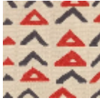
L4307_NIAME Y_B93_B02_B9 2_FE