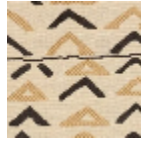
L4307_NIAME Y_N3002_N30 04_FE