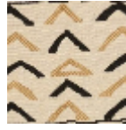
L4307_NIAME Y_N3004_B54_ FE