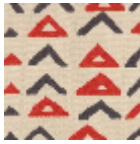
L4307_NIAME Y_B93_B02_B9 2_FE