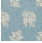
L4333_BOMBA Y_B45_FE_Ver so