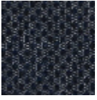
L4340_GRAIN_ DE_CAFE_B54 _B53_FM