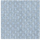
L4340_GRAIN_ DE_CAFE_N30 09_FE