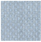
L4340_GRAIN_ DE_CAFE_N30 09_FE