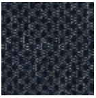
L4340_GRAIN_ DE_CAFE_B54 _B53_FM