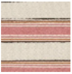
L4342_BIARRI TZ_Bayadère_ B00_B54_B68_ B57_B09