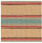
L4342_BIARRI TZ_Bayadère_ B67_B54_B13_ B02_B31