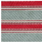
L4342_BIARRI TZ_Bayadère_ N3016_B00_N3 014_B00_N301