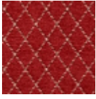
L4344_CROISI LLONS_C520_ FE