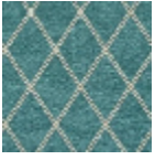
L4344_CROISI LLONS_B65_B 73_FE