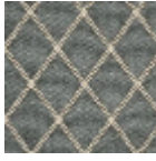
L4344_CROISI LLONS_N3137_ FE