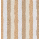
L4346_HOSSE GOR_Bayadèr e_B88_B95_B0 O_B67