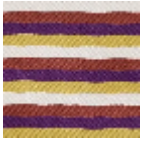
L4346_HOSSE GOR_Bayadèr e_N3005_N301 7_N3020_N302 4