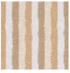
L4346_HOSSE GOR_Bayadèr e_B88_B95_B0 O_B67