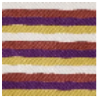
L4346_HOSSE GOR_Bayadèr e_N3005_N301 7_N3020_N302 4