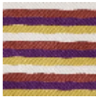
L4346_HOSSE GOR_Bayadèr e_N3005_N301 7_N3020_N302 4