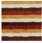
L4346_HOSSE GOR_Bayadèr e_C502_C515_C 522_C509