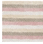
L4346_HOSSE GOR_Bayadèr e_N3008_N30 03_N3006_N30 05