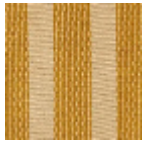
L4358_ARGEL ES_Rayure_C51 6_N3004