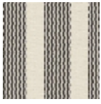
L4358_ARGEL ES_Rayure_B5 4_B00