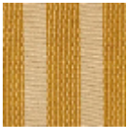
L4358_ARGEL ES_Rayure_C51 6_N3004