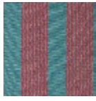
L4358_ARGEL ES_Rayure_N3 014_N3136