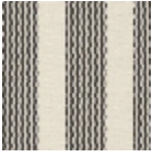
L4358_ARGEL ES_Rayure_B5 4_B00