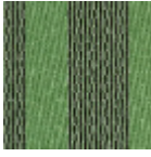
L4358_ARGEL ES_Rayure_N3 002_N3018