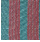
L4358_ARGEL ES_Rayure_N3 014_N3136