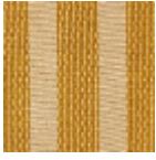
L4358_ARGEL ES_Rayure_C51 6_N3004