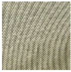
L4373_CONTR EFOND Canevas_FM