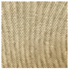
L4373_CONTR EFOND Canevas_FG