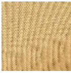
L4373_CONTR EFOND Canevas_FI