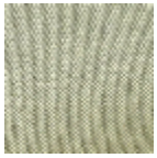
L4373_CONTR EFOND Canevas_FA