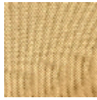
L4373_CONTR EFOND Canevas_FI