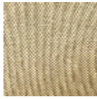
L4373_CONTR EFOND Canevas_FG