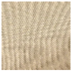
L4373_CONTR EFOND Canevas_FE