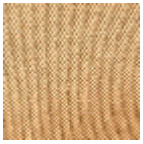
L4373_CONTR EFOND Canevas_FB