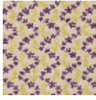
L4388_OPHELI E_N3017_N302 O_FG