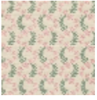
L4388_OPHELI E_B31_N3110_F E