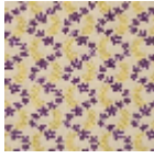
L4388_OPHELI E_N3017_N302 O_FG