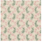
L4388_OPHELI E_B31_N3110_F E