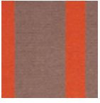
L4398_BATH_ Rayure_B92_B 94