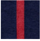
L4398_BATH_ Rayure_C523_ C531