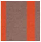
L4398_BATH_ Rayure_B92_B 94