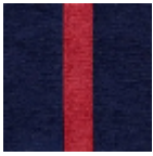
L4398_BATH_ Rayure_C523_ C531