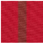
L4398_BATH_ Rayure_N3024 _N3014