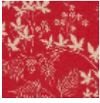
L4415_ERABLE S_B2_FE_VERS O