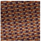
L4432_PIED_D E_COQ_B14_N 3013