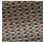
L4432_PIED_D E_COQ_N3012_ N3016