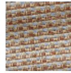
L4432_PIED_D E_COQ_N3158_ N3125