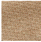
L4441_PIED_D E_POULE_N31 55_N3188