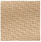
L4441_PIED_D E_POULE_B0_ B67