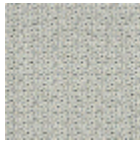
L4445_VELLAS QUEZ_N3127_ N3122_FE