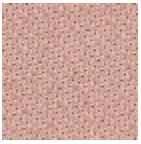
L4445_VELAS QUEZ_B09_B6 5_FE