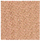
L4445_VELAS QUEZ_N3104_ C539_FE