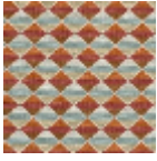
L4449_ARLEQ UIN_Multicolor e_N3021_N302 4_N3013_N302 3_N3016_N300 7_FE