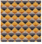
L4449_ARLEQ UIN_Multicolor e_B54_B93_B7 0_B57_B58_B5 6_FE