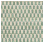
L4513_MINI_BL ASON_N3135_F E