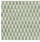
L4513_MINI_BL ASON_N3135_F E