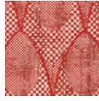
L4519_ZELDA_ N3103_FE_VER SO