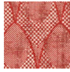
L4519_ZELDA_ N3103_FE_VERS SO