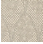
L4519_ZELDA_ B20_FE_VERS O