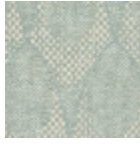
L4519_ZELDA_ C537_FE_VERS O