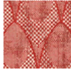
L4519_ZELDA_ N3103_FE_VERS SO