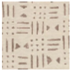
L4520_BAMAK O_B94_B70_F E