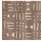
L4520_BAMAK O_B94_B70_F E_VERSO