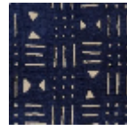
L4520_BAMAK O_C531_FG_V ERSO