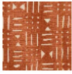
L4520_BAMAK O_B41_B58_FE _VERSO