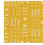
L4520_BAMAK O_N3010_FE_V ERSO