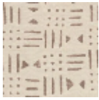
L4520_BAMAK O_B94_B70_F E