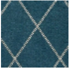
L4530_GRAND S_CROISILLON S_B65_FE