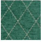
L4530_GRAND S_CROISILLON S_C538_FE