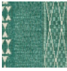
L4532_TOMBO UCTOU_C538_ FE