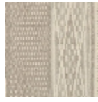
L4532_TOMBO UCTOU_N3003 _FE