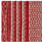
L4532_TOMBO UCTOU_C519_ FM