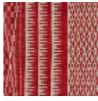
L4532_TOMBO UCTOU_C519_ FM