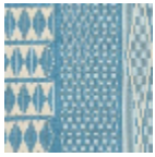
L4532_TOMBO UCTOU_B37_B 39_FE