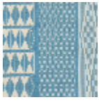
L4532_TOMBO UCTOU_B37_B 39_FE