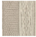
L4532_TOMBO UCTOU_N3003 _FE