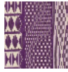
L4532_TOMBO UCTOU_N3020 _FE