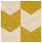
L4534_LES_FL ECHES_B76_F E