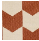
L4534_LES_FL ECHES_N3013_ FE