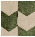
L4534_LES_FL ECHES_C541_F G