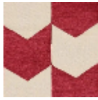
L4534_LES_FL ECHES_C523_F E