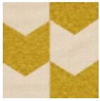
L4534_LES_FL ECHES_B76_F E