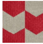
L4534_LES_FL ECHES_N3014_ FM