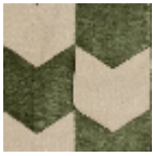
L4534_LES_FL ECHES_C541_F G