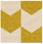
L4534_LES_FL ECHES_B76_F E