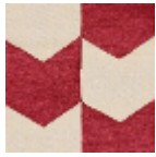
L4534_LES_FL ECHES_C523_F E