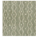
L4535_ZANZIB AR_N3134_FE_ VERSO