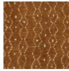
L4535_ZANZIB AR_C512_FE_V ERSO