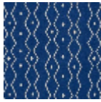
L4535_ZANZIB AR_B53_FE_VE RSO