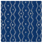
L4535_ZANZIB AR_B53_FE_VE RSO