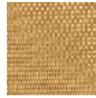
L4540_LOME_ N3143_FE_VER SO