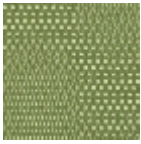
L4540_LOME_ B23_FE_VERS O